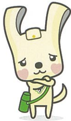
ヨコハマスリム マスコット イーオ "Io"

"I can not remember the day of trash collection. Do you have any suggestions for something good?"