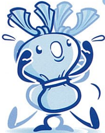
へら星人 ミーオ "Mio"

"I don't know how to separate the garbage! Oh, no! The collection truck will be here soon! Somebody help me!"